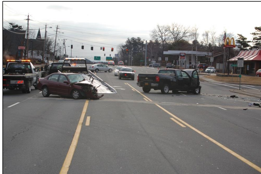
Crash scene on Western Ave. in Guilderland on February 27, 2016

For more information, please contact Cecilia Walsh (518) 275-4710 or cecilia.walsh@albanycountyny.gov .