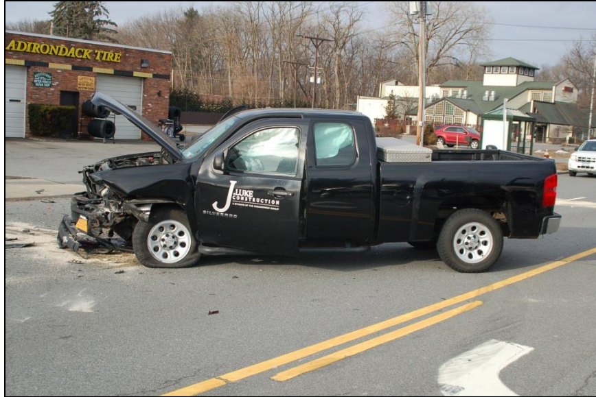
PRICES'S vehicle following the crash.